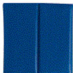
Front: Two segments