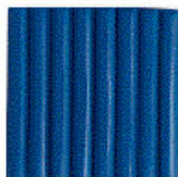
Reverse: Eight segments

Each FIMO CLASSIC block consists of eight segments, helping you to mix precise colours.