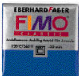
FIMO-CLASSIC 63g - Block

Are you a real expert? Then there is interesting news for you: Good old FIMO has turned FIMO CLASSIC. Its formula has remained unchanged: still the best quality for filigree modelling. All the colours can be combined with FIMO SOFT. Well, what's new then? We have optimised the colours in terms of blending. Which gives you the choice of a vast palette of intermediate hues. There are 24 standard colours which blend into 100 different shades as shown in our blending table on the reverse. Just choose your favourite.